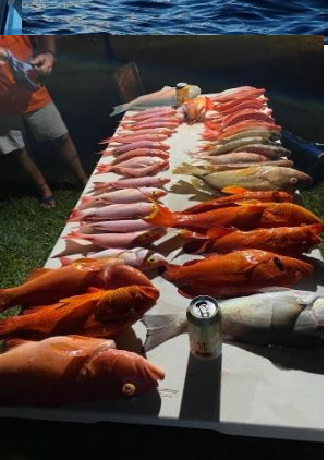
Neil with some nice fish from 1770