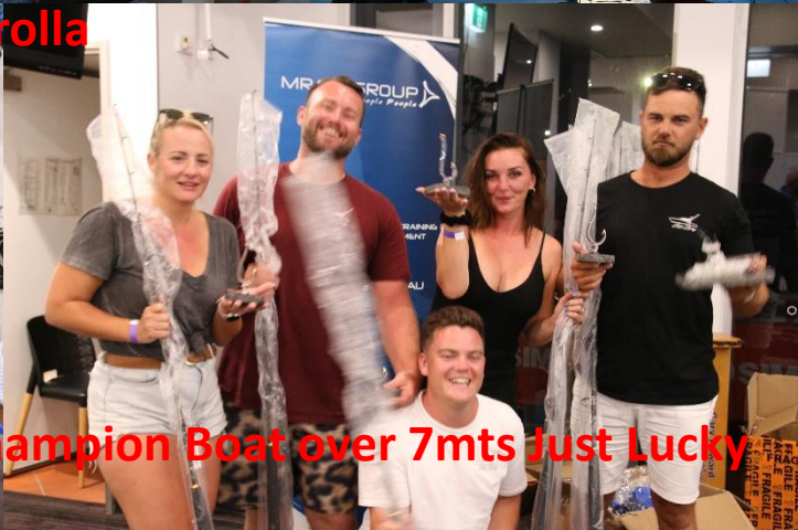
Champion Boat over 7mts Just Lucky