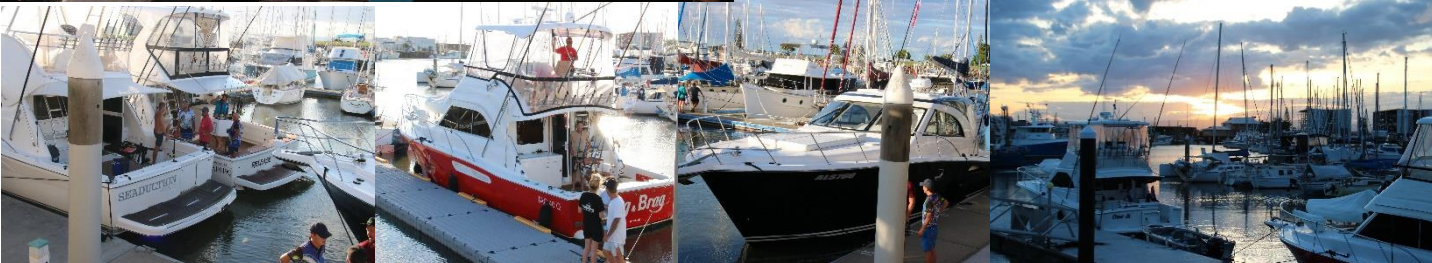
Champion Boat Under 7mts Coka Krolla