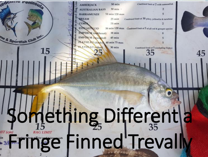
Something Different a Fringe Finned Trevally