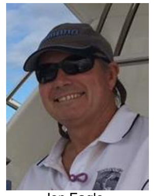
Jon Eagle Recorder