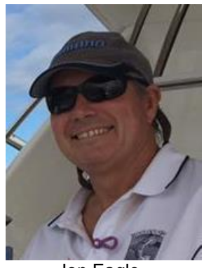
Jon Eagle Recorder