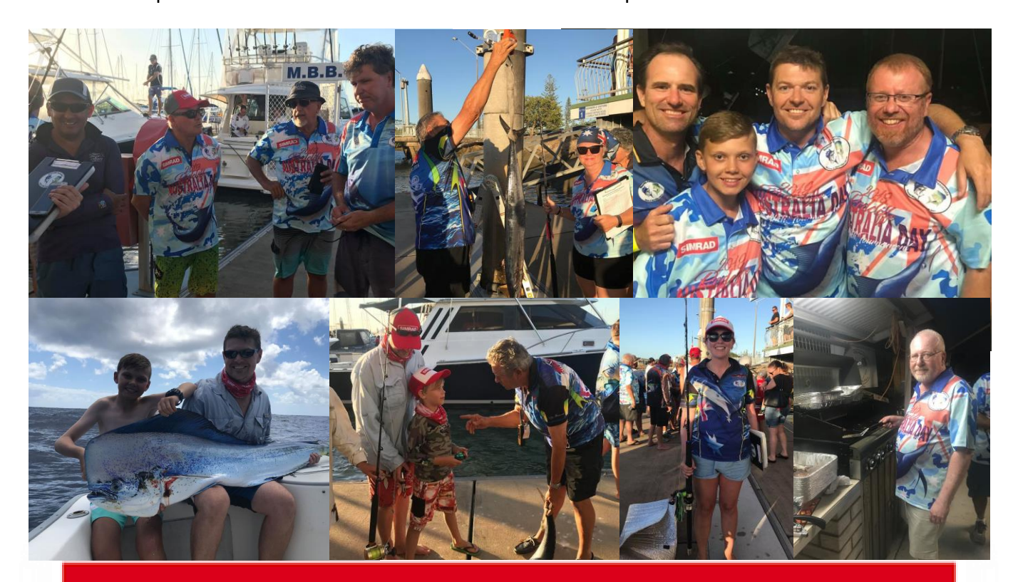
Champion Boat under 7m - Life's Great