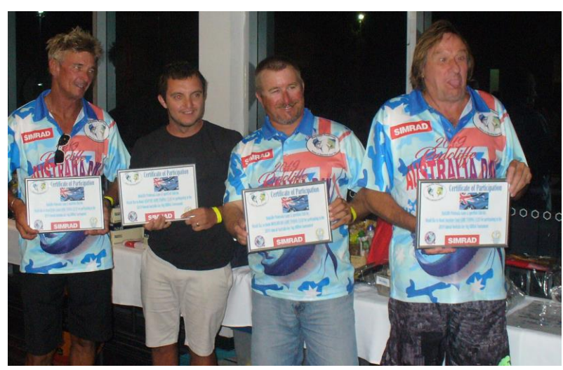
Representatives from other clubs who fished the Australia Day Billfish Tournament