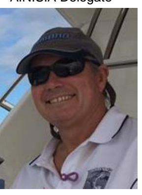
Jon Eagle Recorder