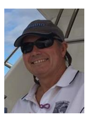
Jon Eagle Recorder