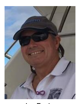
Jon Eagle Recorder