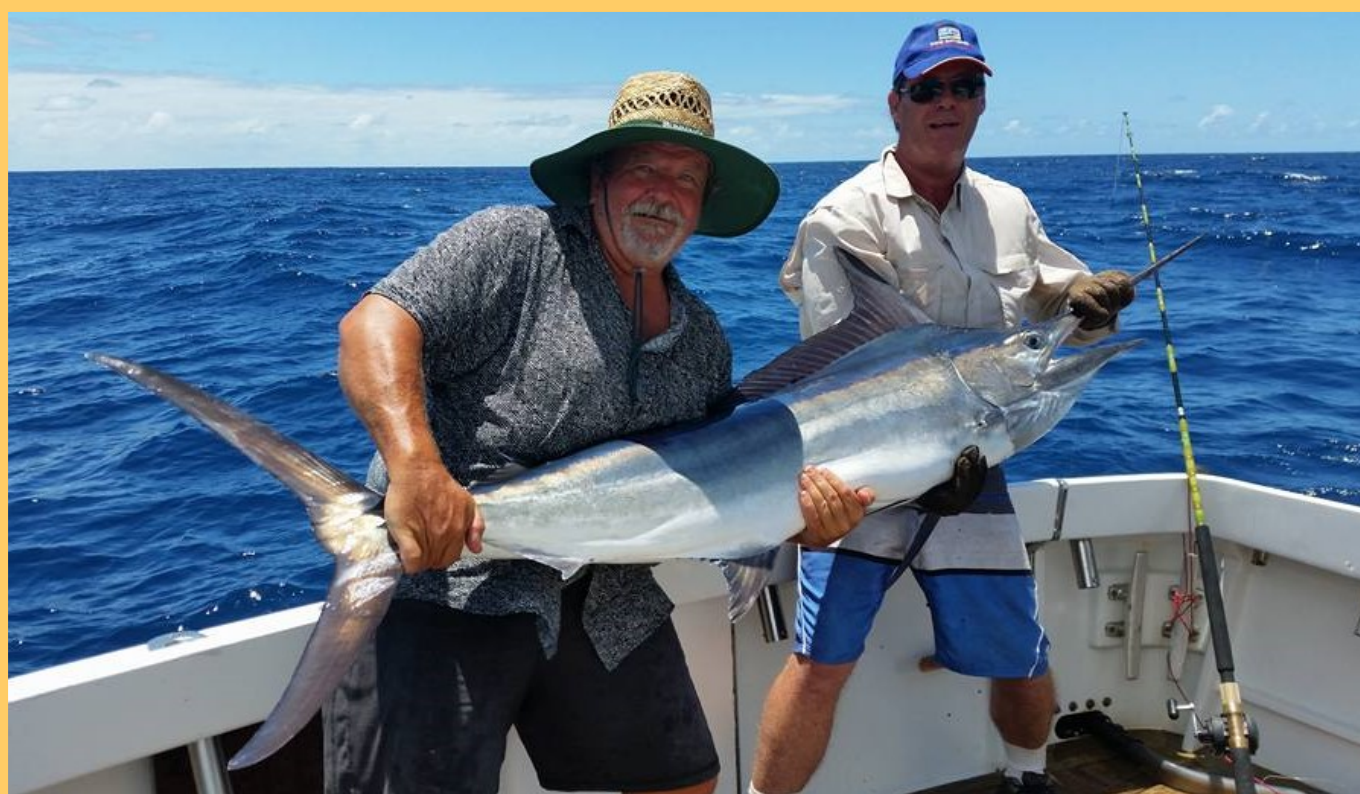
The team aboard 'Witchdoctor' with a marlin they tagged in the Brisbane Marine 2017 Redcliffe Australia Day 8kg Tournament.