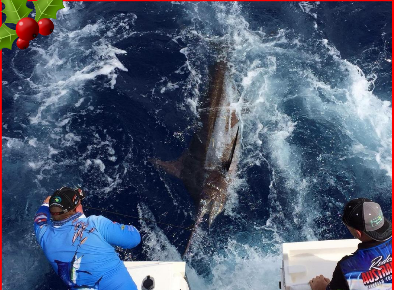
Team Big Business showing everyone how it's done - congratulations team - nice fish!