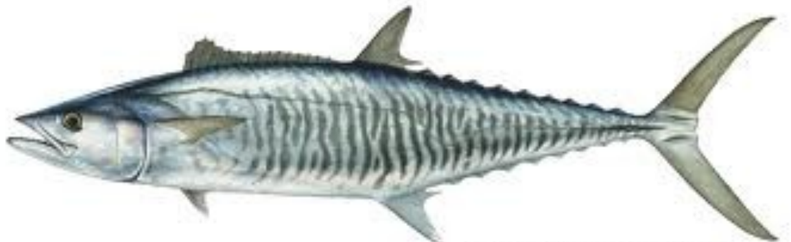
Peebles Spanish Mackerel