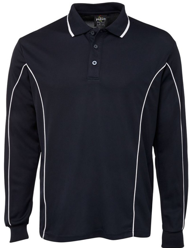
Long Sleeve Polo