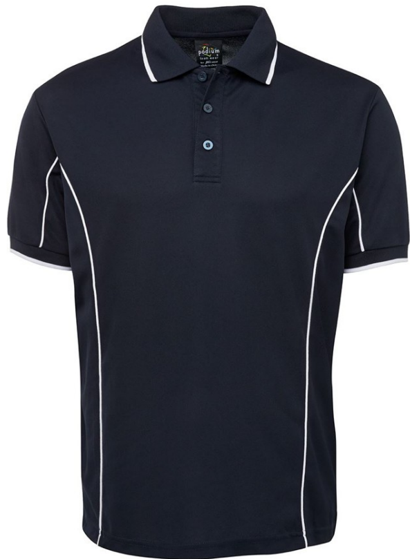
Men's Short Sleeve Polo