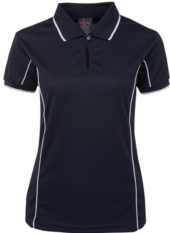
Lady's Short Sleeve Polo