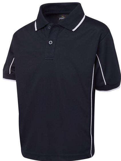
Kid's Short Sleeve Polo