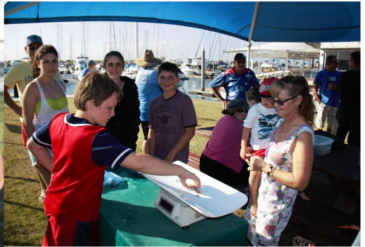
Some of the boys sharing a drink and having a great time once again once again