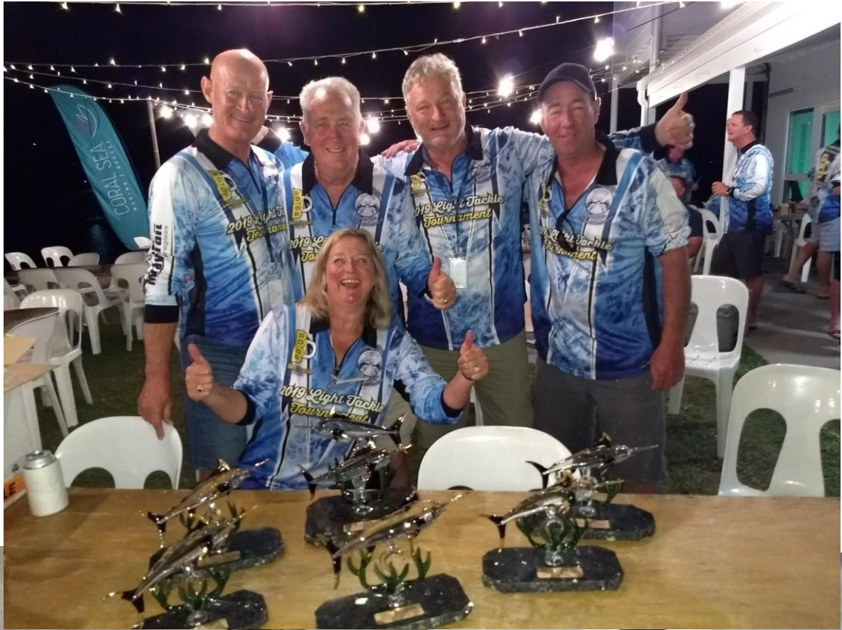
Photos from Over It at the recent Whitsunday Gamefish Comp – winners are grinners!